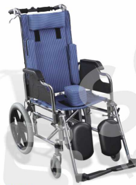
Model No. R-105