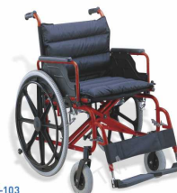
Model No. D-103