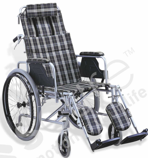
Model No. R-101