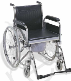
Model No. C-102 • Flip up arm rest & detachable, swinging foot rest