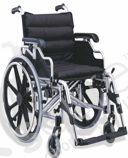
Model No. D-101