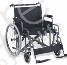
Model No. D-105 • The Model designed for obese (over weight) disable person • Heavy duty steel frame with epoxy powder coated