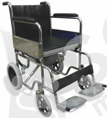
Model No. C-106 • Flip up arm rest & detachable, swinging foot rest

The below mentioned facilities are common in all here shown models