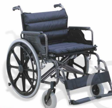
Model No. D-104 • The Model designed for obese (over weight) disable person • Heavy duty steel frame with epoxy powder coated