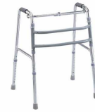
Model No. WL-102