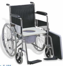
Model No. C-101 • Fixed arm rest & foot rest