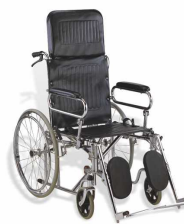
Model No. R-102