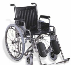
Model No. R-104