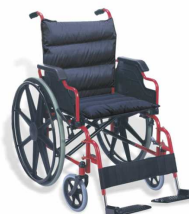
Model No. D-102 • Epoxy powder coated steel frame