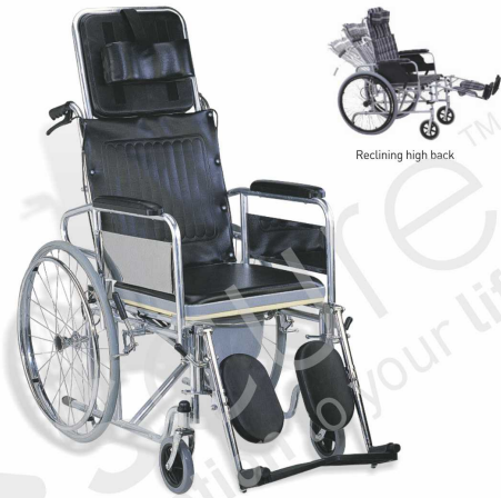
Model No. C-103