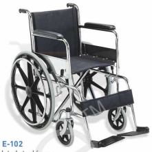
Model No. E-102 • Chrome plated steel frame • Fiber molded mag wheel • Fixed arm rest & foot rest