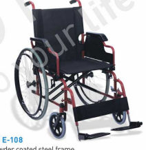
Model No. E-108 • Epoxy powder coated steel frame • Flip up arm rest • Detachable footrest

The below mentioned facilities are common in all here shown models