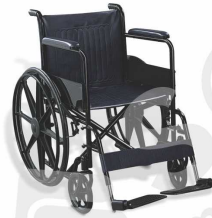
Model No. E-107 • Epoxy powder coated steel frame • Fixed arm rest & foot rest • Fiber molded mag wheel