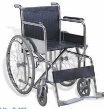
Model No. E-101 • Chrome plated steel frame • Fixed arm rest & foot rest